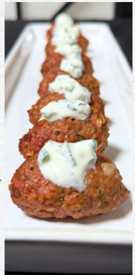
Beef and Lamb Kofta with Mint Tzatziki Sauce