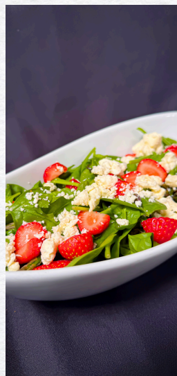
Strawberry Spinach Salad