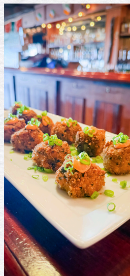
Vegan Crab Cakes

quinoa, fava bean, lemon, avocado, radish, watercress, cumin, olive oil