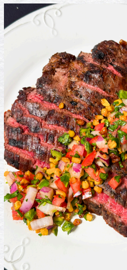
Chipotle Flank Steak with Corn Salsa

chocolate, raspberry, half and half, egg