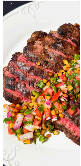
Chipotle Flank Steak with Corn Salsa

chocolate, raspberry, half and half, egg