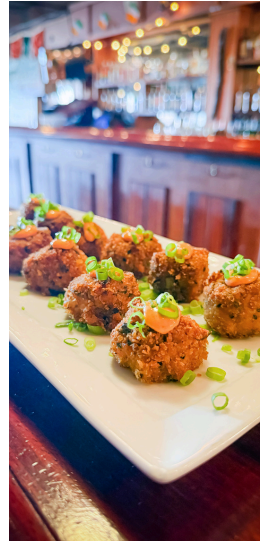
Vegan Crab Cakes

quinoa, fava bean, lemon, avocado, radish, watercress, cumin, olive oil