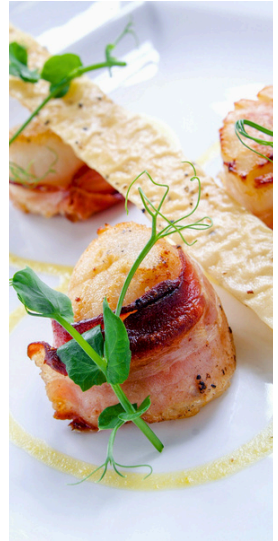
Bacon Wrapped Scallops

mushroom, mixed greens, endive, garlic, lemon, shallot, capers, parsley, olive oil