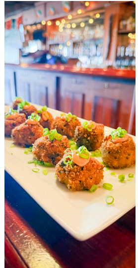
Vegan Crab Cakes