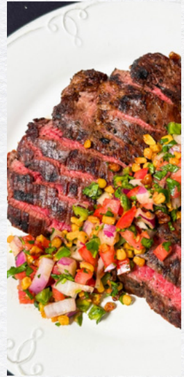
Chipotle Flank Steak with Corn Salsa

chocolate, raspberry, half and half, egg