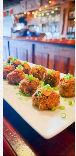
Vegan Crab Cakes

quinoa, fava bean, lemon, avocado, radish, watercress, cumin, olive oil