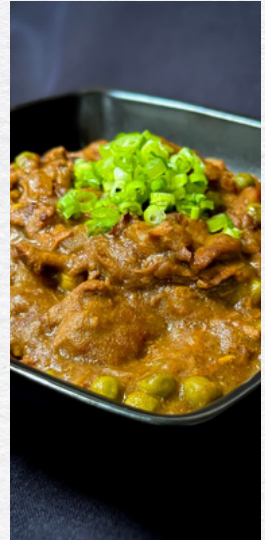
Japanese Curry Beef

chocolate, cream, milk, sugar, gelatin, popcorn