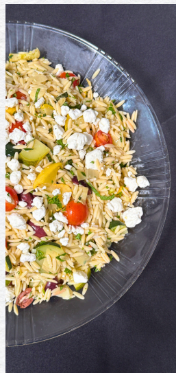
Orzo and Goat Cheese Salad

almond, hazelnut, flour, egg, sugar, chocolate, cream, milk