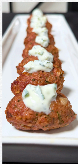
Beef and Lamb Kofta with Mint Tzatziki Sauce