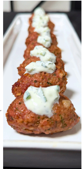
Beef and Lamb Kofta with Mint Tzatziki Sauce