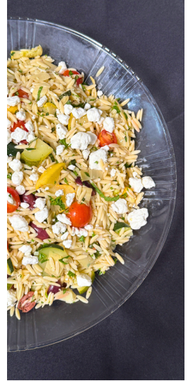
Orzo and Goat Cheese Salad

almond, hazelnut, flour, egg, sugar, chocolate, cream, milk